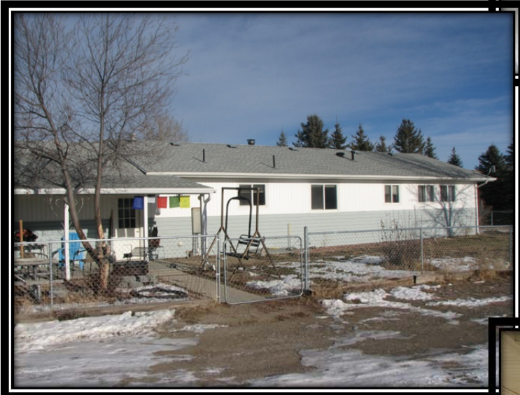
Back Fenced Yard