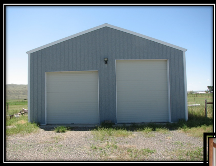
30 x 40 Shop