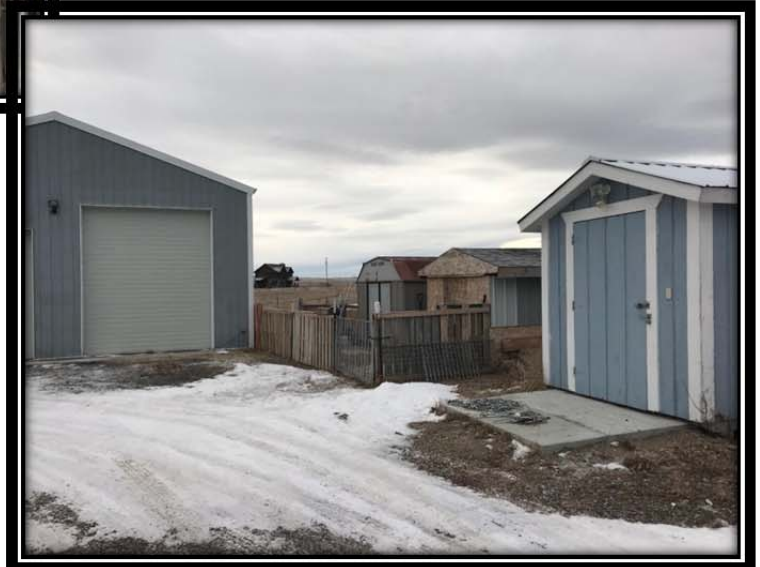
Sheds & Shop