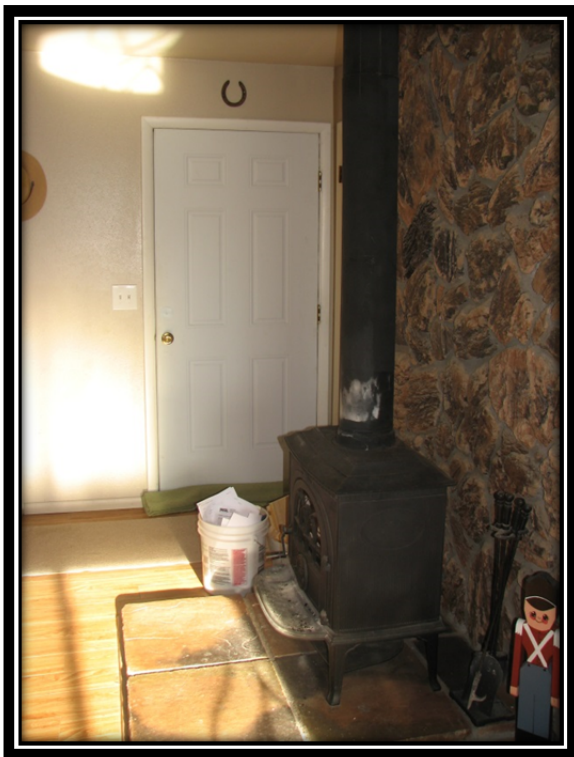
Wood Stove in Living Room