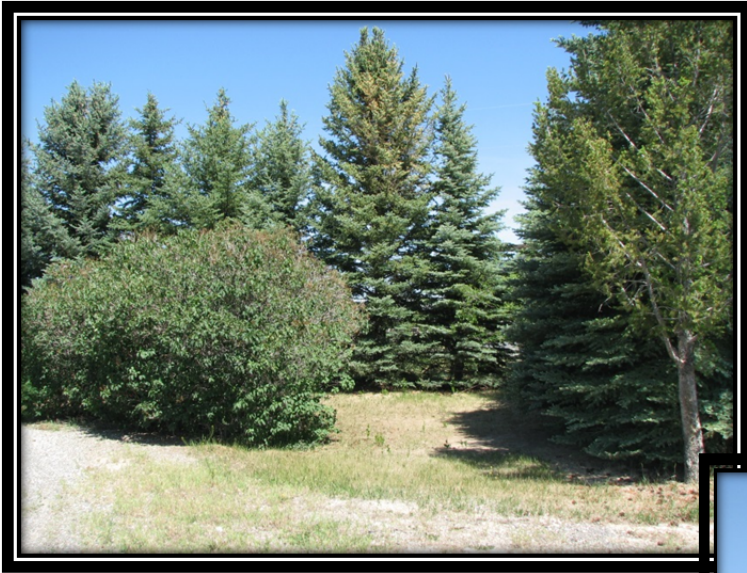
Trees on Property