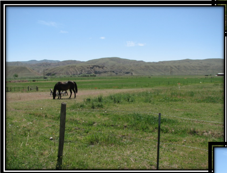
View of McCullough Peaks